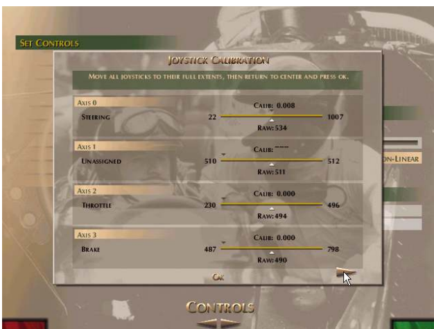
STEP 5: Steer left and right, press gas and brake (do not press hard), then click on the arrow at the bottom right