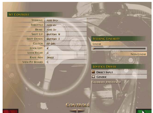
STEP 10: Click the green box in the lower right