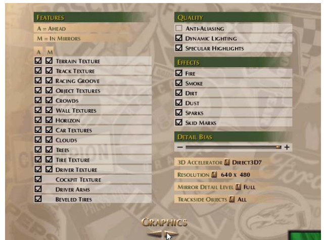
STEP 2: Click the arrow at the bottom to get to the CONTROLS page