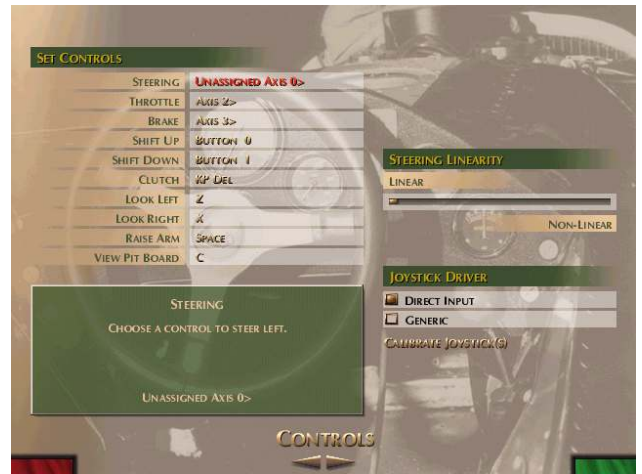
STEP 8: Turn the wheel to the left, repeat the process for each control assignment