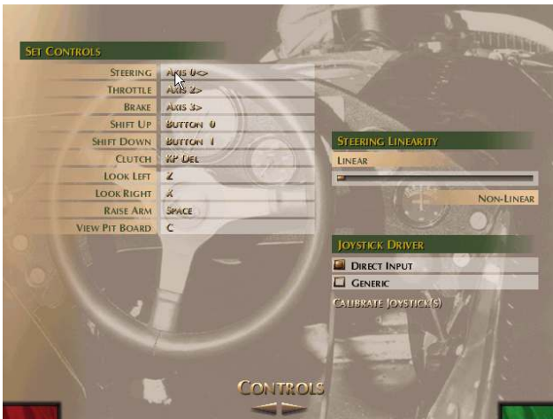
STEP 7: Click on Steering