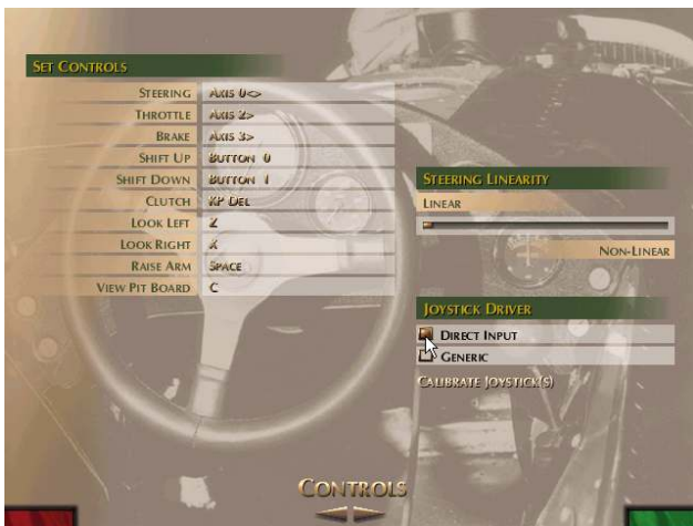
STEP 3: Set the Joystick Driver to DIRECT INPUT