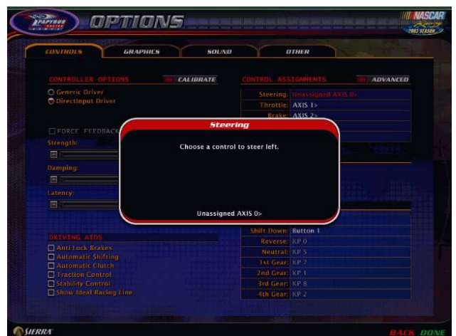
STEP 6: Steer Left, repeat process for all control assignments