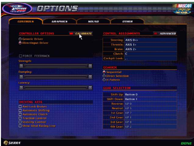
STEP 3: Click on Calibrate