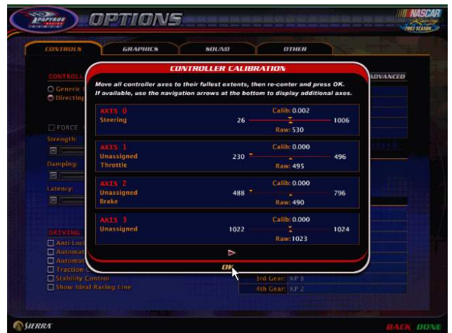
STEP 4: Turn the wheel left and right, press all pedals (do not press them down hard), then press OK