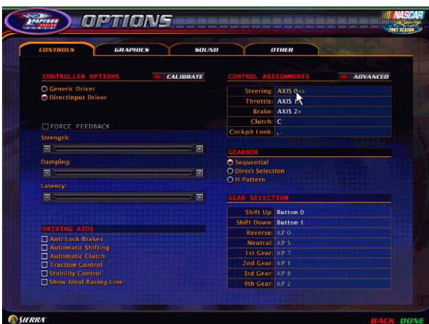
STEP 5: Click on Steering Assignment